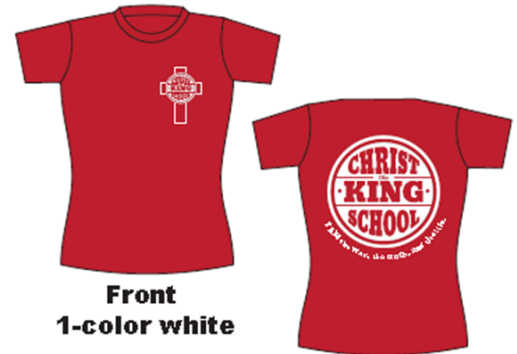
Front 1-color white